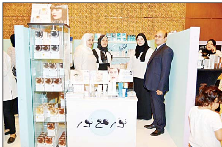
A photo from the event

■ Al-Raya United Turkish Company, a Turkish real estate company.