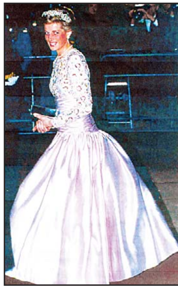
Diana, Princess of Wales, at the Kuwait British Embassy on March 13, 1989.