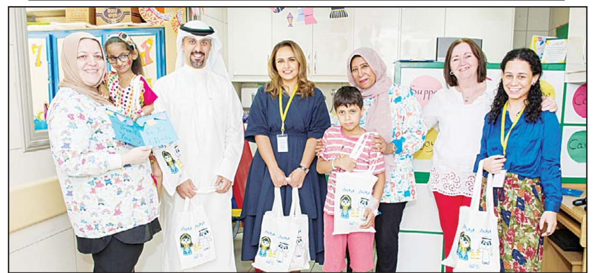
ABK and KACCH staff with children at Farwaniya Hospital.

Fawzia Sultan Healthcare Network is a multidisciplinary non-profit clinic based in Kuwait. It employs a highly specialized team of clinicians, providing exceptional quality of healthcare services and compassionate care across a number of specialty areas including: pediatric rehabilitation (at its Children Evaluation & Rehabilitation Centre: CER), family medicine, preventative medicine, mental health and wellness, physiotherapy & occupational therapy, speech therapy, neurology, elderly care, women's health and research and education.