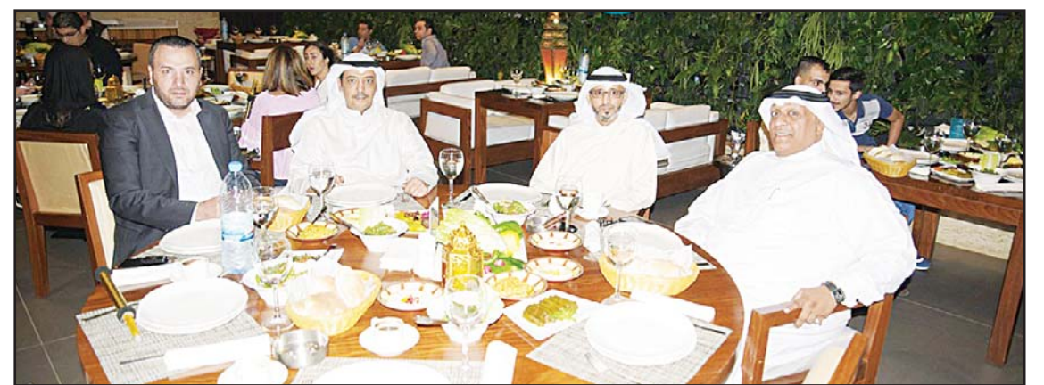
A photo from the event

For more information about ABK please visit eahli.com or contact an ABK customer service agent via 'Ahli-an Ahli' at 1899899.